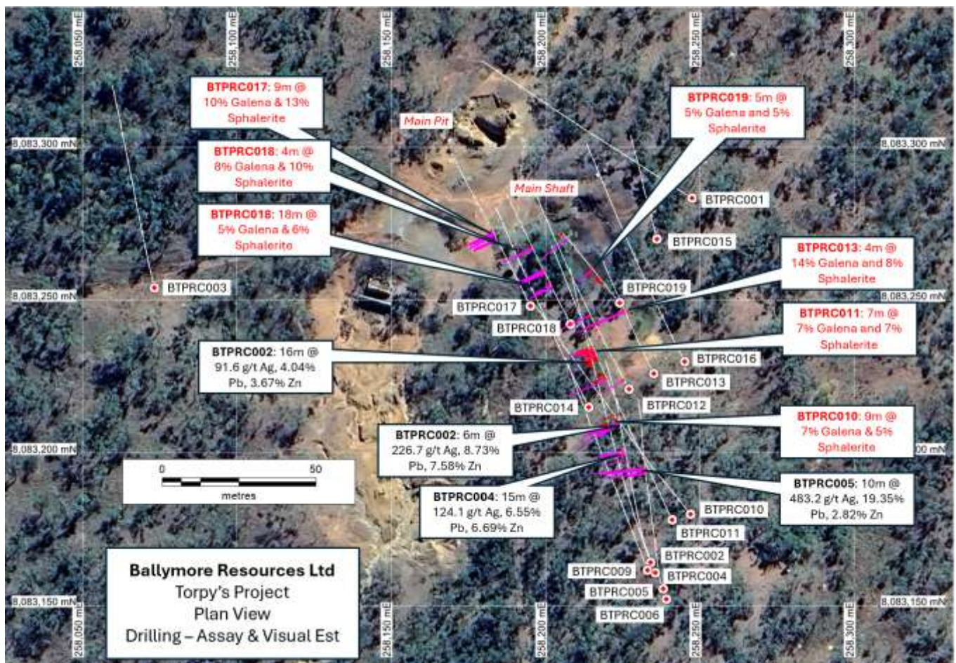
Figure 1 – Aerial photo of the drill hole location at Torpy's.