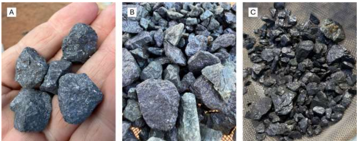
Figure 2 – Examples of galena and sphalerite mineralisation in current drill holes (A) Percussion chips of massive galena mineralisation from BTPRC017 (49 – 50m); (B) Percussion chip samples with strong galena-sphalerite mineralisation estimated at 15% galena and 20% sphalerite 5 in chlorite-altered sediments from BTPRC017 (49 – 50m); (C) Percussion chip samples with strong galena-sphalerite mineralisation estimated at 15% galena and 25% sphalerite 5 in chlorite-altered sediments from BTPRC018 (27 – 28m).

These visual estimates continue to support Ballymore’s interpretation that Torpy’s hosts a robust high-grade silver-lead-zinc system with potential for significant growth.